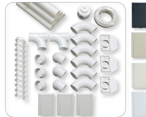
3 point DIY Kit

Installation methods are so simple that most systems can be installed in any new or existing constructions in just a few hours. Aussie Vac also supplies complete D.I.Y kits with detailed instructions should you wish to install your own system. Technical support is available from our friendly staff, just call!