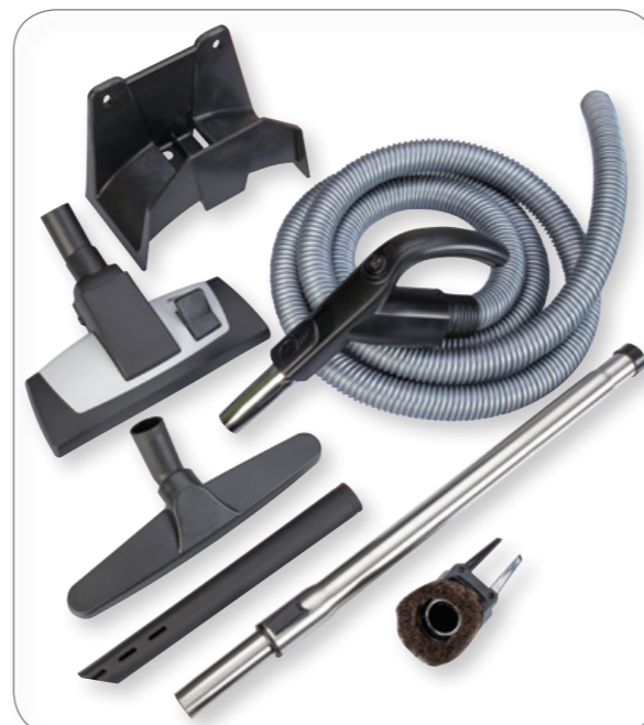
Switch Hose Kit