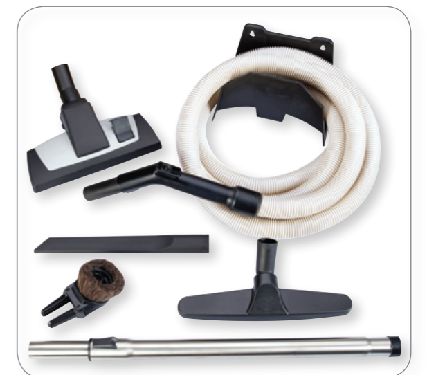
Deluxe Hose Kit

Since 1972, Aussie Vac has been designing, manufacturing, and installing ducted vacuum systems backed up by excellent workmanship and customer service. This has made us the No. 1 ducted vacuum specialist for over 40 years. You can rest assured that our family owned and operated Australian company will still be here 30 years from now.