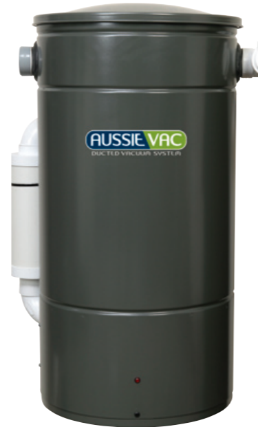
Aussie Vac power unit

* TABLE INFORMATION BASED ON MOTOR MANUFACTURERS SPECIFICATIONS.